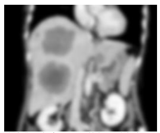
Fig. 2. Example of an unacceptable low-resolution image