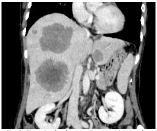
Fig. 3. Example of an image with acceptable resolution